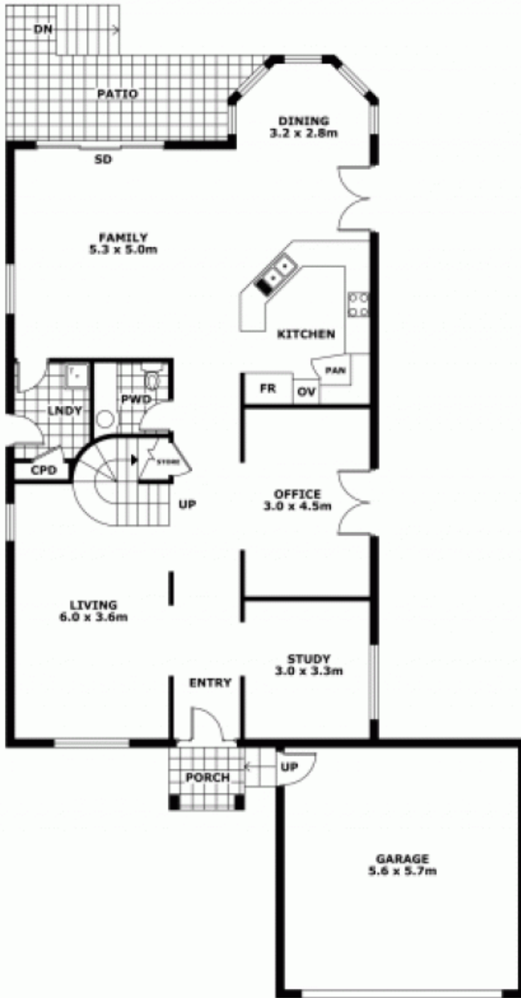
GROUND FLOOR LEVEL