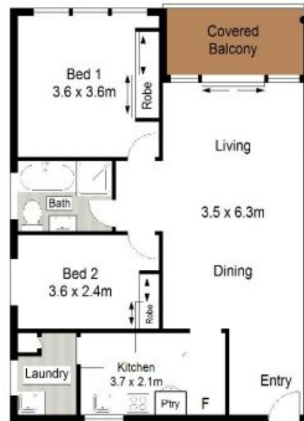
ELEVATED GROUND FLOOR