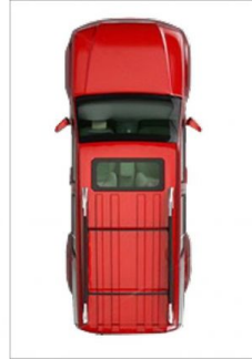
Shared off-street parking